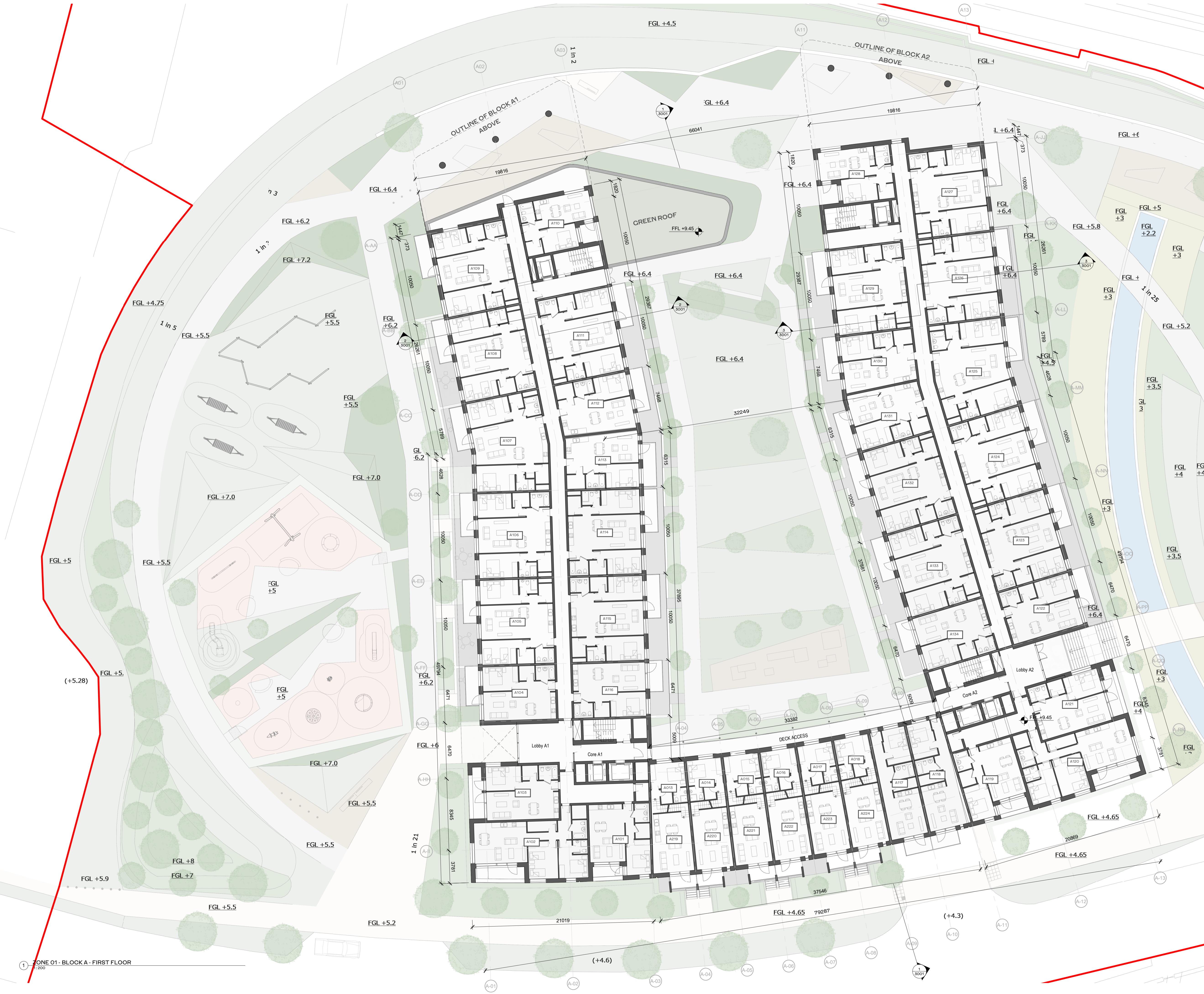
1 ZONE 01 - BLOCK A - FIRST FLOOR 1:200

Henry J Lyons Architecture + Interiors +353 1 888 3333 info@henryjlyons.com 53-54 Pearse Street Dublin D02 K466